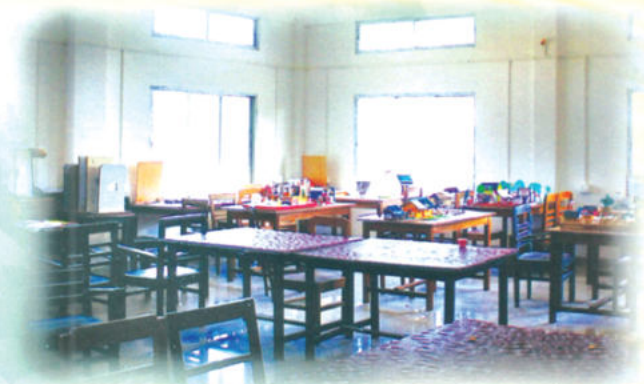
LABORATORY, DEPARTMENT OF EDUCATION