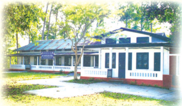
POST GRADUATE STUDY CENTRE