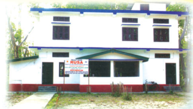
NEW COLLEGE CANTEEN