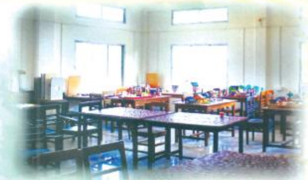
LABORATORY, DEPARTMENT OF EDUCATION