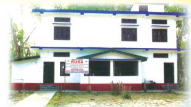
NEW COLLEGE CANTEEN