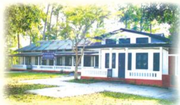
POST GRADUATE STUDY CENTRE